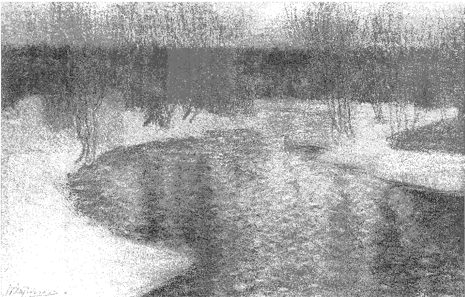
Figure 3. Vilhelms Purvītis. Winter Landscape (c. 1900–1904, State Museum of Art, Riga).

Vilhelms Purvītis (1872–1945) in the moody studies from the time of his 1904 one-man exhibition. Purvītis's monumental and classicising later achievements made people forget this delicate aspect of his early work, but I would like to save it from the undue oblivion by discussing one of those few surviving pastel studies (c. 1900–1904, State Museum of Art, Riga) that were praised for their serene lyricism and give the best possible evidence to some unobtrusively metaphoric developments in the art of the new 20th century. We must agree that the study is raffiniert in der komplizierten Wirkung einfacher Mittel (Neumann? 1904) – the