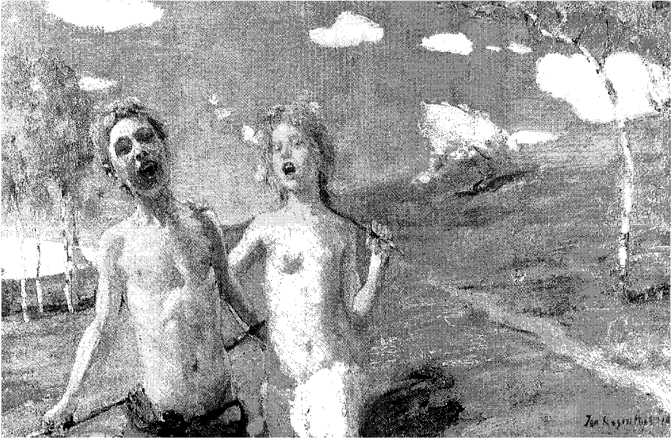
Figure 1. Janis Rozentāls. Jubilant Children (1901, State Museum of Art, Riga).

leans upwards as if wishing to join other, white clouds in their procession over the sky. Rosy tints of the blossoming tree and twigs reappear in the youthful flush on the girl's cheeks, and these children could ask the same question as Latvian writer Jānis Akuraters (1876–1937) in his Servant Boy's Summer : "And my joy, is it not unconscious as that of some young plant or flower that, fresh and lush, blooms in the sunshine?" (Akuraters 1908: 144.)