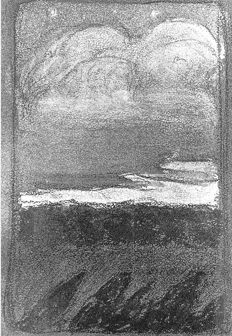
Figure 6. Pēteris Krastiņš. Clouds (c. 1905–1907, State Museum of Art, Riga).

bound and strongly claustrophobic "inscape," this term being borrowed from something so far from art history as Laurens van der Post's interpretation of Jungian psychology (Van der Post 1976: 20, 146). There are heavy clouds looming large over the landscape or transformed into indistinct, threatening masses, and there is the dark, spongy, quivering mire with gloomy remnants of decayed vege-