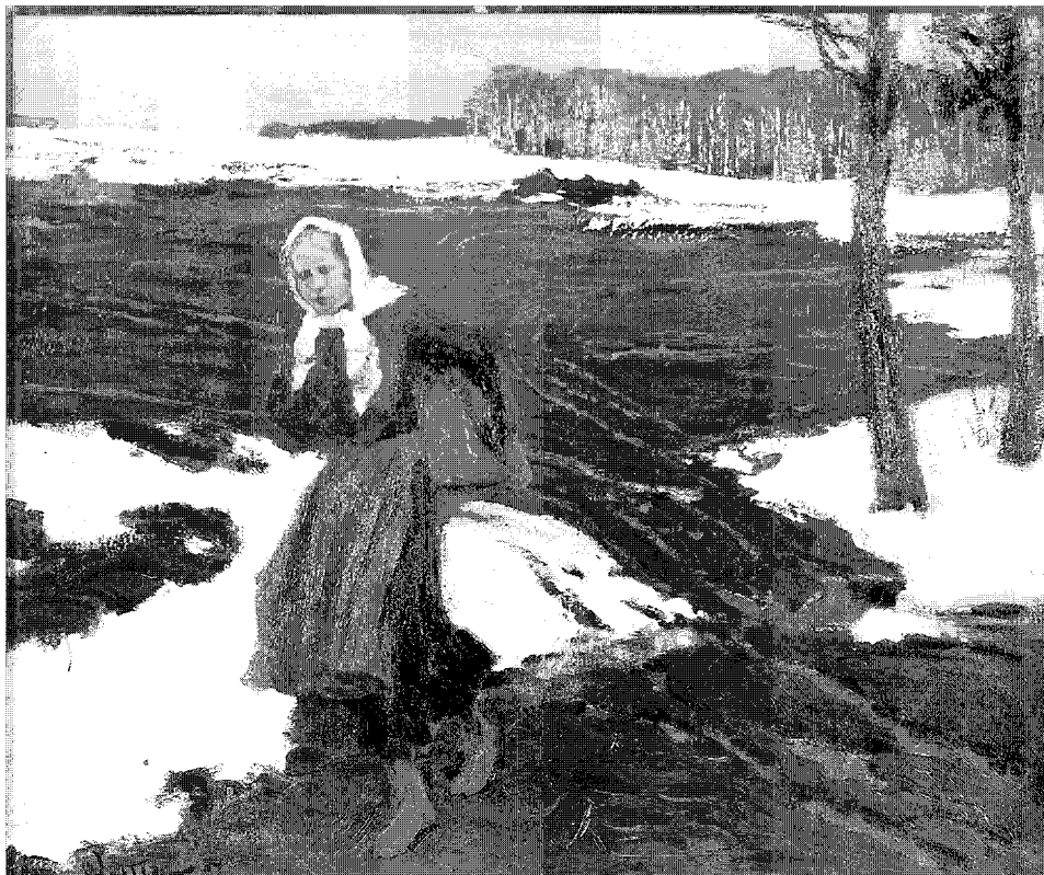
Figure 4. Johann Walter. Spring (1907, State Museum of Art, Riga).

sional picture itself, but it often contained a represented surface of quiet, vibrant or rippling water with distinct and clear or dim and blurred reflections. The water mirrored something that was only partly shown or totally left beyond the boundaries of the depicted scene, and this intricate playful arrangement even in modest studies usually helped to achieve admirable pictorial integrity.